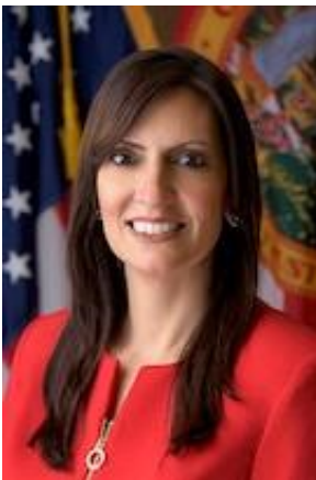
Jeanette Nuñez Lieutenant Governor Florida