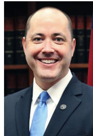
Chris Carr Attorney General Georgia