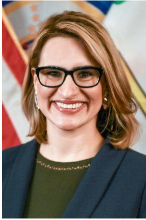
Peggy Flanagan Lieutenant Governor Minnesota