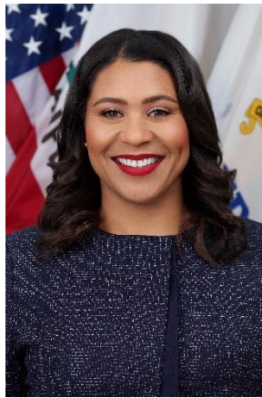
London Breed Mayor of San Francisco California