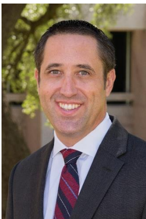
Glenn Hegar State Comptroller Texas