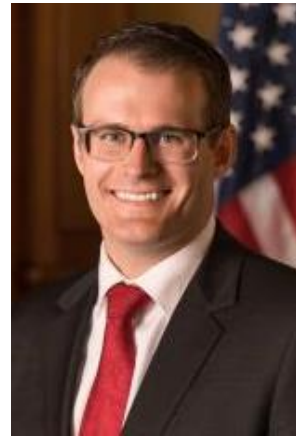
Adam Gregg Lieutenant Governor Iowa