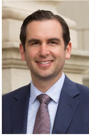
Steven Fulop Mayor of Jersey City New Jersey