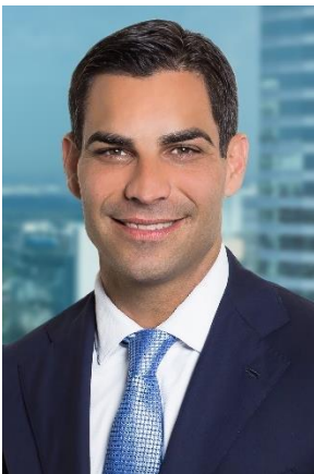
Francis Suarez Mayor of Miami Florida