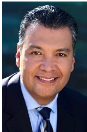
Alex Padilla Secretary of State California