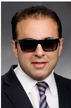
Cyrus Habib Lieutenant Governor Washington