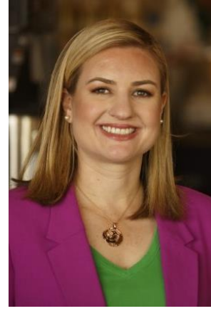
Kate Gallego Mayor of Phoenix Arizona